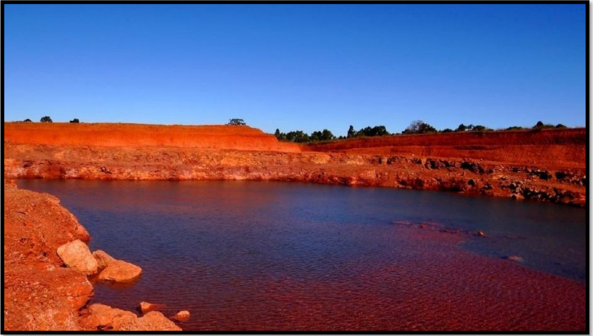
(Rainwater Harvesting Pond at Bhusar mine)