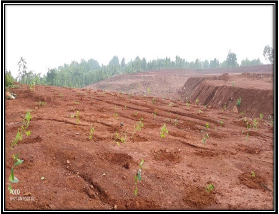
(Plantation at Bhusar Bauxite mine)