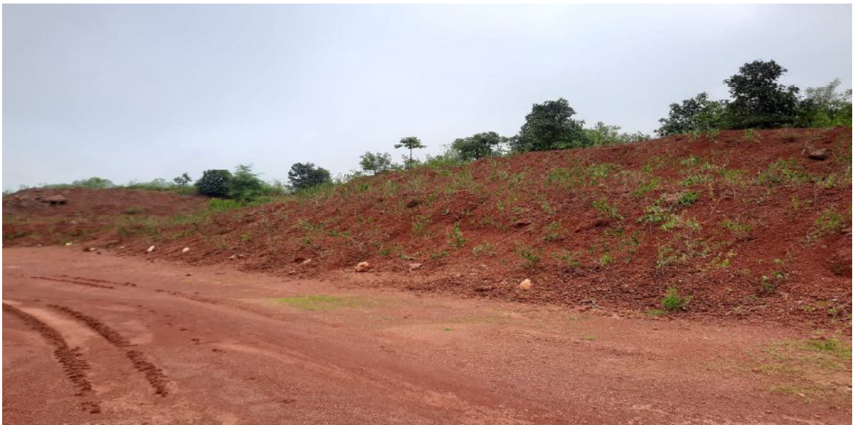
(Stylohameta, Sindwar & Lantana For Slope Stability)