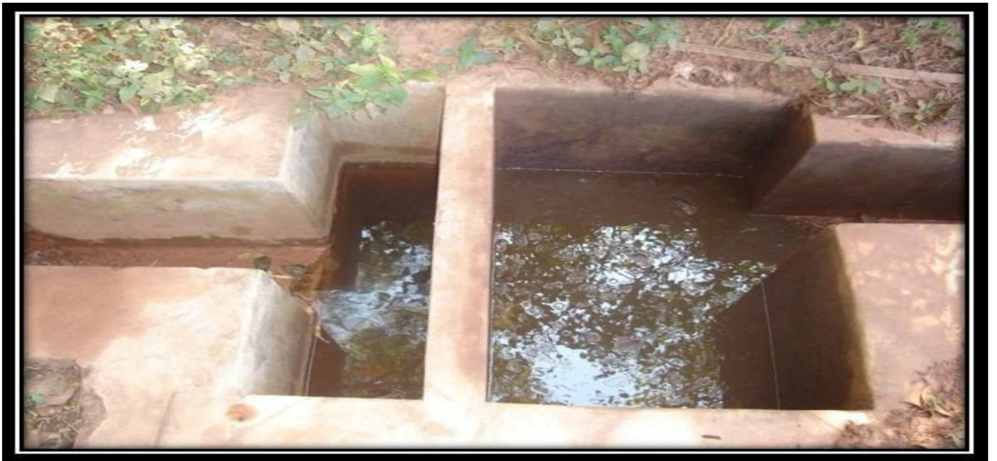
(Oil & Grease Trap)