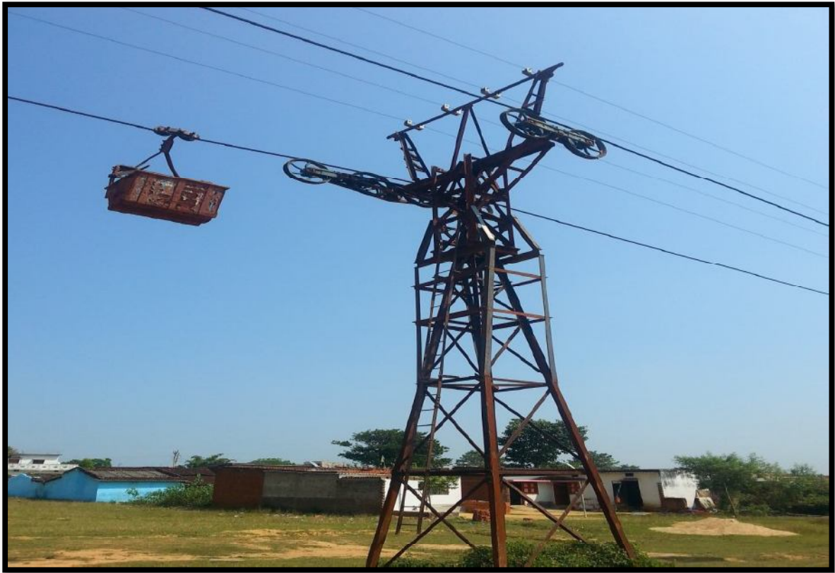
(Ropeway transportation- eco-friendly)