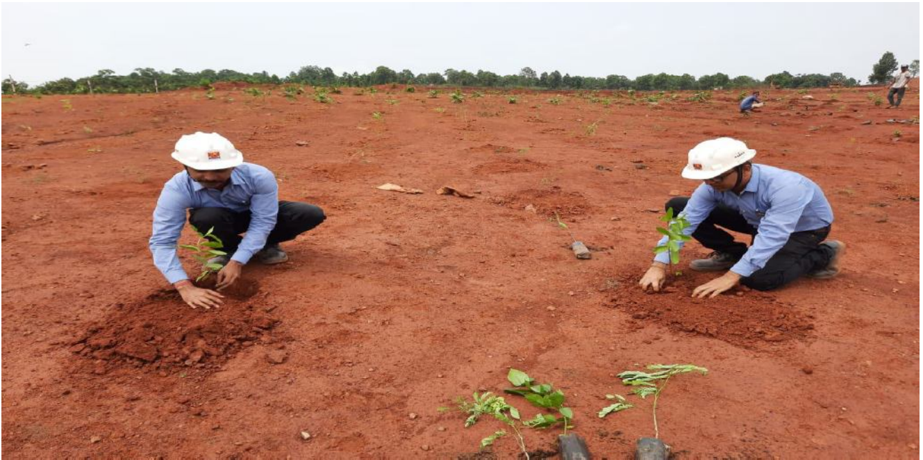
(Plantation at Bhusar Bauxite mine)