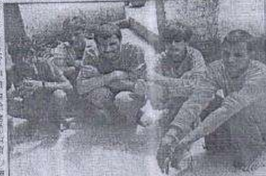
पुलिस ने अंतर्गत सक्रियता को हुए पारी के न पारि-पारो उर न जुआरियों को डकन समायक इजाजत रूपय मद कराने के लया पाई है।