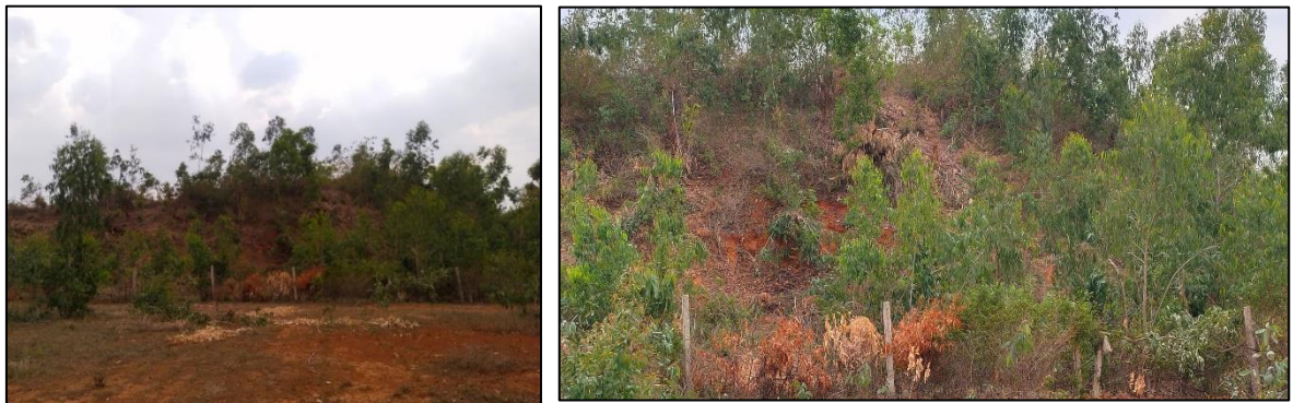
Plantation in Old OB Dump

Reply to Condition 6: Presently there is no active OB dump at mines. As per approved Mining Plan OB generated during mine operation is being utilized for concurrent back filling of the mined-out area for reclamation purpose. Small old inactive OB dump of an area of 1.66Ha. has been stabilized by vegetation with suitable native species to prevent erosion and surface run off. Garland drain with check dam have been provided to arrest silt and sediments flowing from above mentioned OB dump.