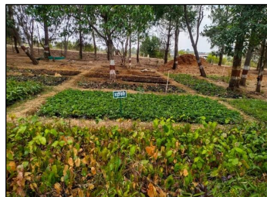
Plant Sampling culture in our Nursery