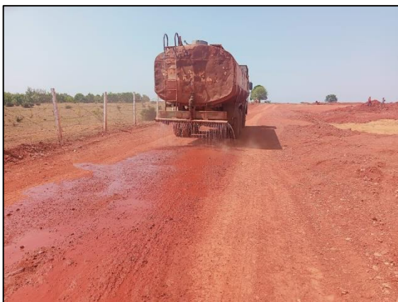
Water Sprinkling in haul road

Reply to Condition 6: Wet drilling, regular water spraying with 12 KL portable water tanker in the mine lease hold area is being carried out regularly to control the fugitive emission at source. Rainwater collected into the mine pit is being utilized for dust suppression purpose. Black top road has been constructed up to pit head to reduce dust problem.