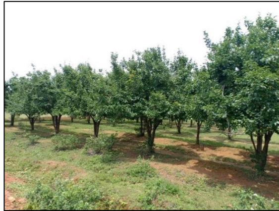
Plantation for Noise Acoustic barrier

Reply to Condition 7: The noise level in working area is being maintained below the prescribed limit. As protective measures, workers engaged in operations of HEMM, etc. is being provided with ear plugs / muffs. The proper maintenance of HEMM is being carried out to control noise emission.