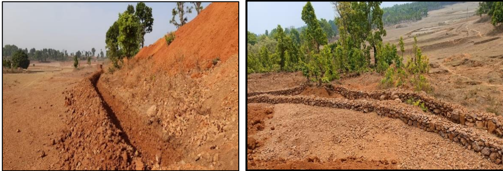
Photographs of garland drains and parapet wall

Reply to Condition 7: Garland drains approx. 200m long along with retaining wall of appropriate size (1m height x 0.5m width x 250m length) and gradient have been made around the active mining pits coupled with silt arrester to arrest silt from run-off and drains are being maintained and desilted at regular intervals before monsoon. The Water is being collected in the sump and used for plantation & in sprinkling of the Haul Road. The sump capacity Rainwater pond of adequate capacity has also been developed.