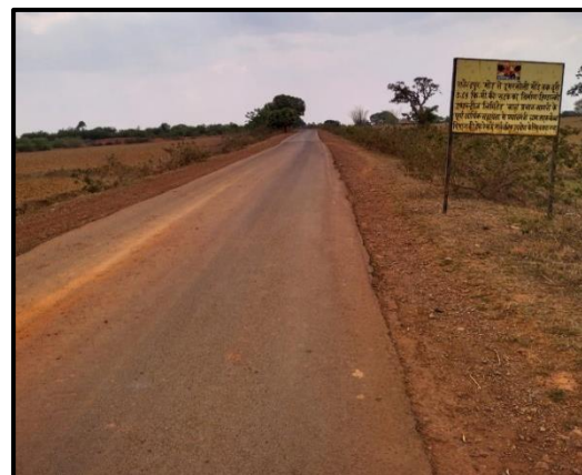
Black top Road to the mines