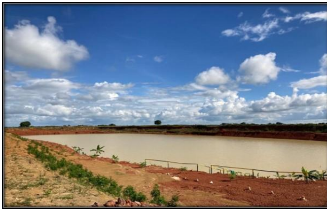
Rain Water Harvesting Pond

Reply to Condition 11: Six nos. of rainwater harvesting Ponds of an area approx. 7.9Ha. and well of size 5Ft.X10Ft. have been constructed as conservation measures in mined out area for the conservation/augmentation of ground water resources. This further adds to Water Credit of the lease area.