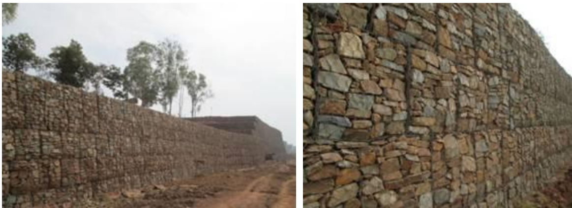
Photo: Gabion & Reinforced Soil Wall

RMP capacity augmentation work completed in Sep'2017 with Gabion retaining wall technology as designed and drawings approved by the IIT Mumbai; the design is full proof and ensures stability of height of red mud stacking in RMP4.