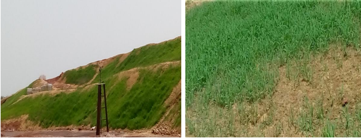
Photo: Green belt development in RMP by hydro-seeding technology

Green belt developed in by growing grass on RMP by hydro-seeding technology (from USA) 1.0 acre and further 8.82 acres is planned to complete by Jun 2018. It is helping to improve green belt in RMP as well as reduce the fugitive dust emission.