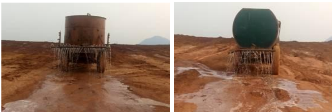
Photo: Dedicated water tanker in RMP area and road to suppress dust