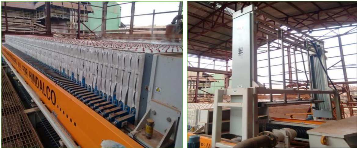
Photo: Pressure Filter