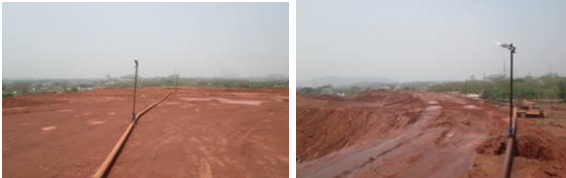
Photo: Dust suppression system with water sprinklers in the periphery of RMP.

Dust suppression system with water sprinklers along the road and periphery of RMP and dedicated water tanker in RMP area and road to suppress dust.